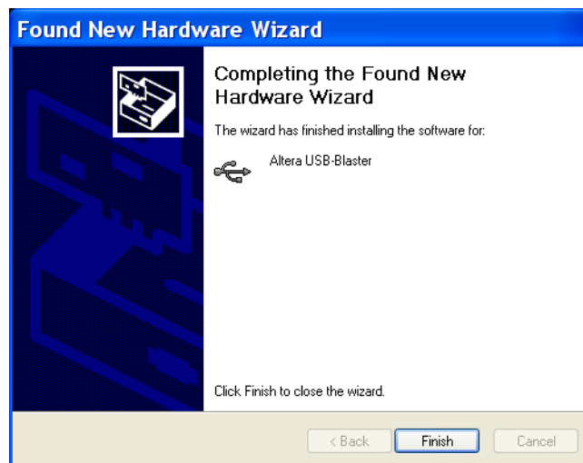
Figure 6. The driver is installed.

The driver will now be installed as indicated in Figure 6. Click Finish and you can start using the DE2 board.