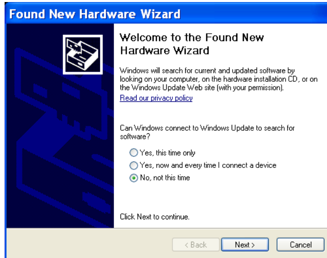
Figure 1. Found New Hardware Wizard.

Since the desired driver is not available on the Windows Update Web site, select No, not this time in response to the question asked and click Next. This leads to the window in Figure 2.