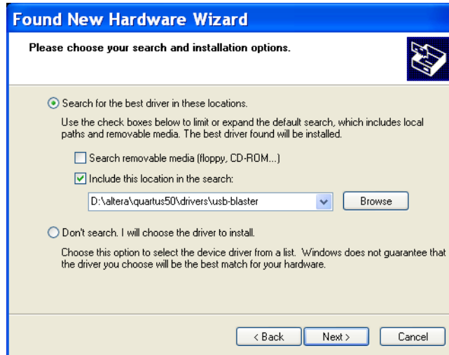
Figure 3. Specify the location of the driver.

Now, choose Search for the best driver in these locations and click Browse to get to the pop-up box in Figure 4. Find the desired driver, which is at location altera\quartus50\drivers\usb-blaste . Click OK and then upon returning to Figure 3 click Next . At this point the installation will commence, but a dialog box in Figure 5 will appear indicating that the driver has not passed the Windows Logo testing. Click Continue Anyway .