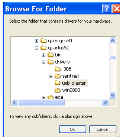
Figure 4. Browse to find the location.

Now, choose Search for the best driver in these locations and click Browse to get to the pop-up box in Figure 4. Find the desired driver, which is at location altera\quartus50\drivers\usb-blaste . Click OK and then upon returning to Figure 3 click Next . At this point the installation will commence, but a dialog box in Figure 5 will appear indicating that the driver has not passed the Windows Logo testing. Click Continue Anyway .