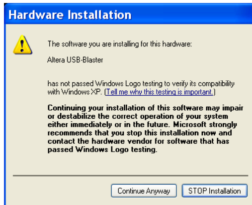
Figure 5. There is no need to test the driver.

The driver will now be installed as indicated in Figure 6. Click Finish and you can start using the DE2 board.